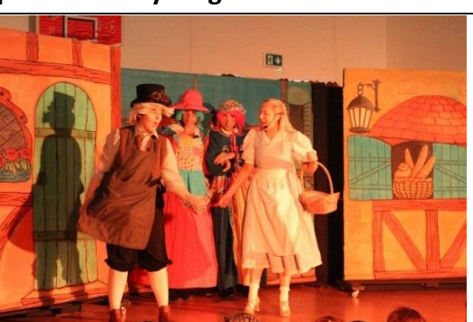
Our younger children were treated to a fun, colourful and dynamic pantomime production of Beauty and the Beast last week.