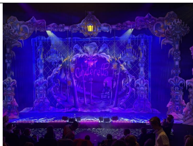
Key Stage 2 visit to the Northcott Theatre to watch a pantomime