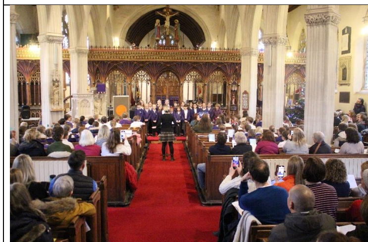
Key Stage 2 Christingle at St Disen's Church