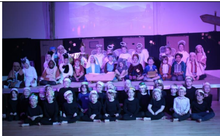
Key Stage 1 production of The Big Little Nativity