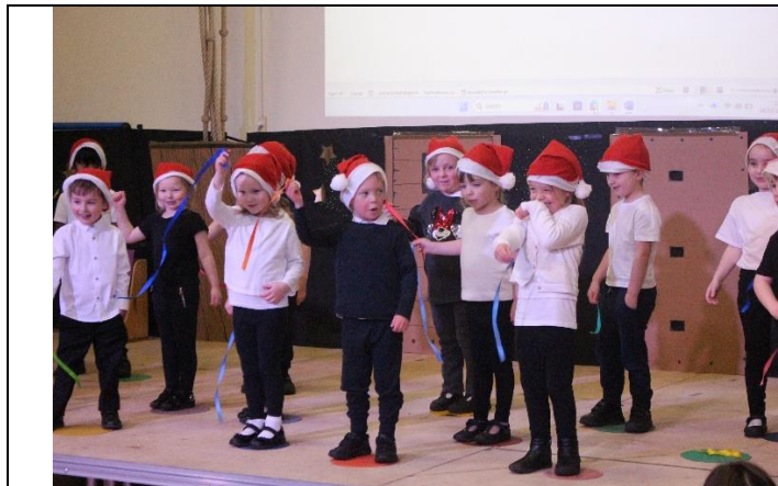
Reception Christmas performance