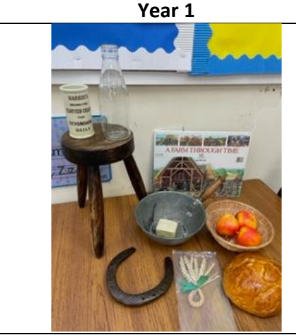
In history, we have been exploring artefacts loaned to us from Tiverton Museum.