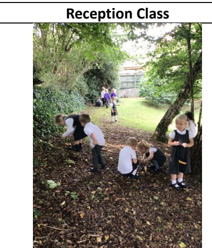
We have been looking for signs of Autumn and getting to know the outside areas of school.