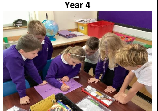
In English, we have been exploring how using a range of vocabulary can make our writing more interesting and exciting.