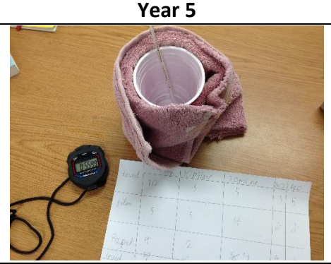
In science, we have been investigating which material makes the best thermal insulator.