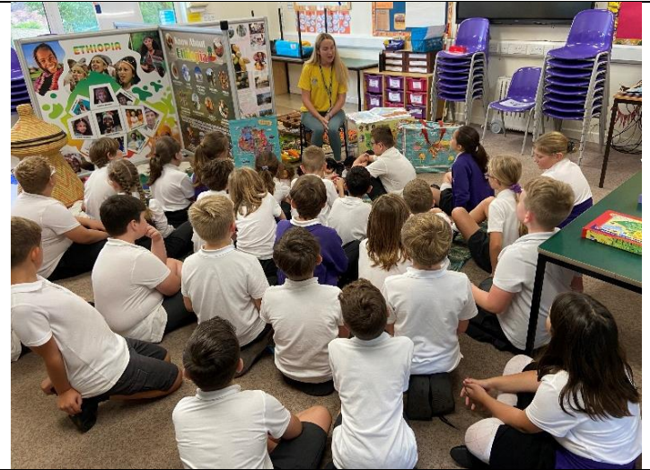
Interactive class workshops learning about different cultures from around the world