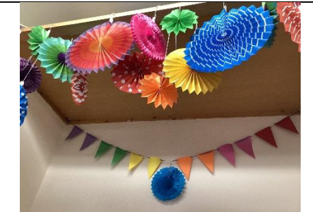
Our Key Stage 1 photography club began this week. We started by learning how to hold our equipment still and focus to capture a clear image. We are looking forward to developing our nature photography over the coming weeks.