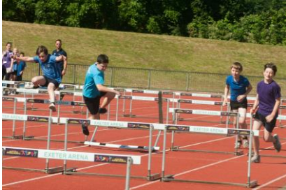
Ventrus Sports Day