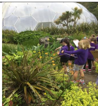
KS1 Eden Project