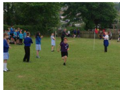
CVSA Football league finals