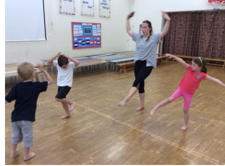
KS1 Dance Club