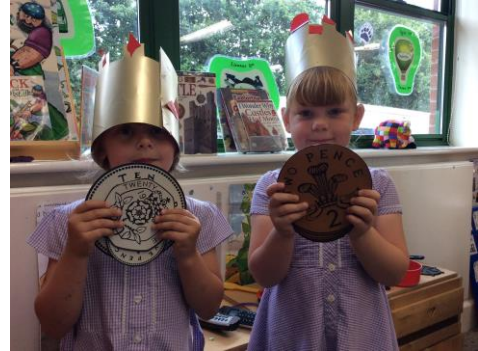
Foundation - learning the value of money!