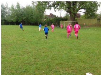
Yr 5/6 football vs Sampford Peverell