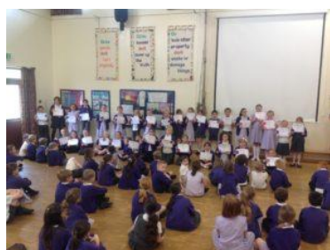
KS1 and KS2 Gymnastics