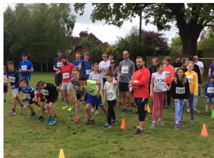
The Duchy Dash