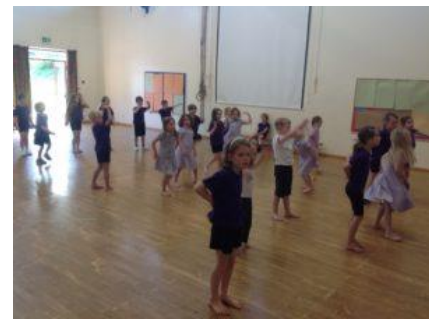
KS1 and KS2 Street Dance Tasters