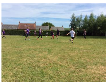
Y6 v Teachers!