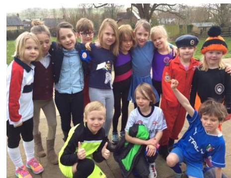
dressing as sporting heroes