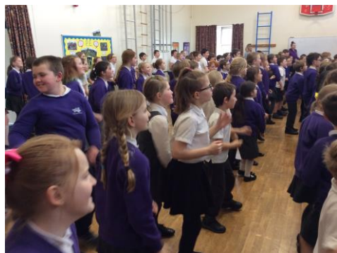
whole school fitness