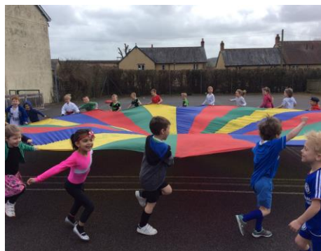
parachute games in Cook