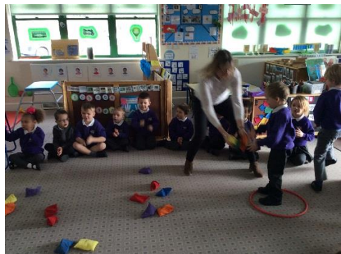
aiming skills in Foundation