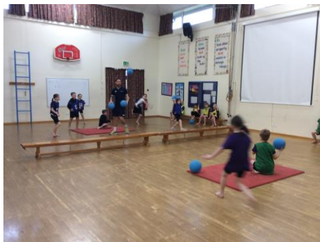
PE in Drake