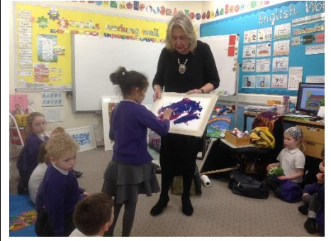
artist visit to Cook Class