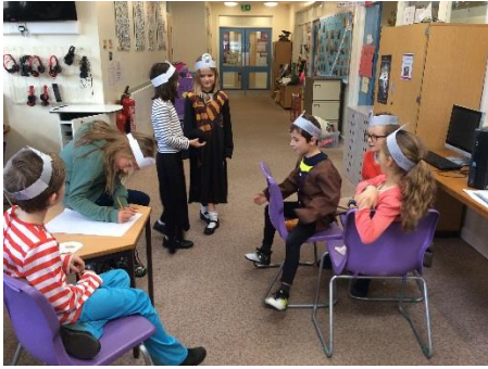
World Book Day