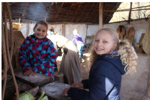
Drake at Escot