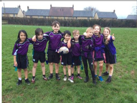
Y3/4 tag rugby