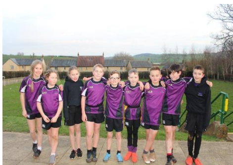
Y5/6 tag rugby