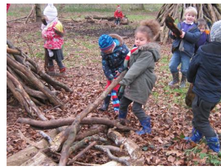
Foundation at Killerton