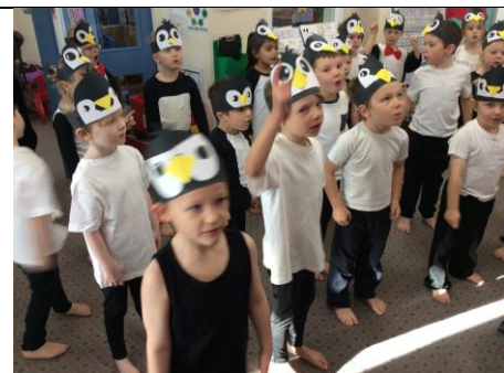
KS1 rehearsing for their Christmas Winter Wonderland .