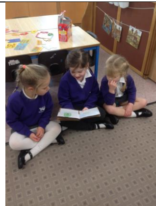
Cook Class wrote their own stories and read them to the Foundation children.