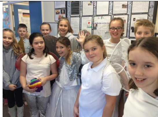
KS2 rehearsing for their Christmas production of Operation Emmanuel .