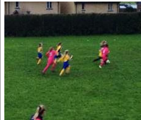
Girls Football against Wilcombe The Duchy girls won!