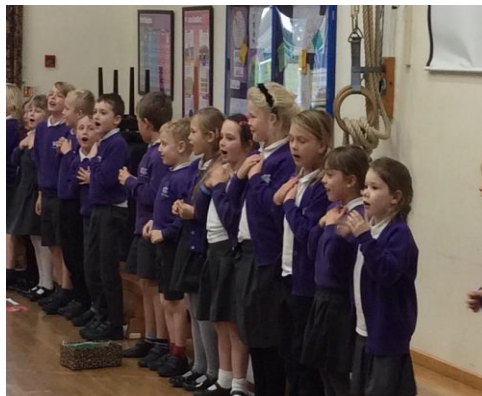
Raleigh Class assembly