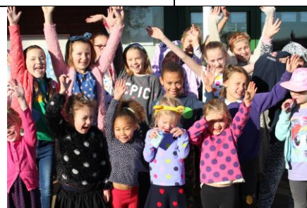
Children in Need 2017 Thank you for your donations!